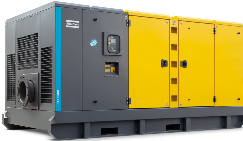
Indicative picture of the product

Diesel - Qmax 2,160 m 3 /h (9,510 USgpm) - Hmax 71 m (233 ft)