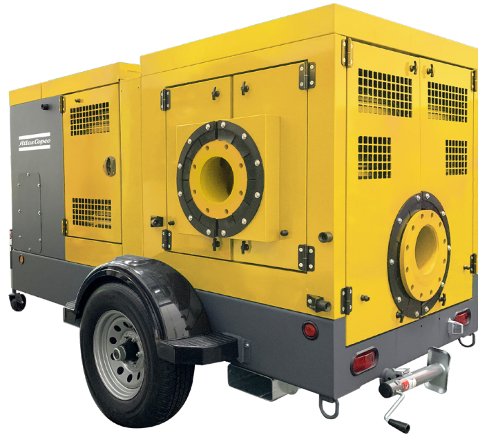
Indicative picture of the product

Diesel - Qmax 850 m 3 /h (3,740 USgpm) - Hmax 50 m (164 ft)