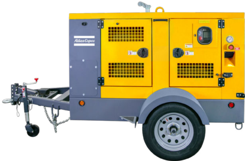
Indicative picture of the product

Diesel - Qmax 510 m 3 /h (2,250 USgpm) - Hmax 51 m (167 ft)