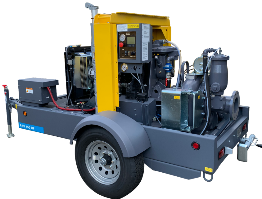
Indicative picture of the product

Diesel - Qmax 510 m 3 /h (2,250 USgpm) - Hmax 51 m (167 ft)