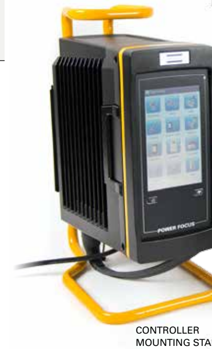
CONTROLLER MOUNTING STAND